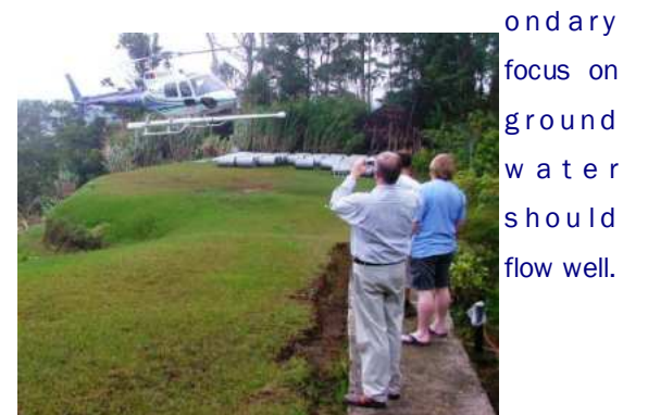
Helicopter returning from survey flight

With those and the quality staff, services from the division to both mining stakeholders in their primary focus of geological data and their secondary