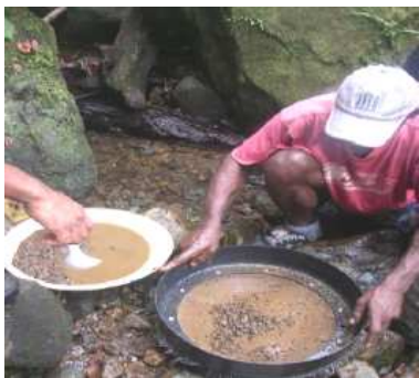
Geologists taking stream and pan concentrate samples to analyze under the European Union funded Geo Map program.

The Geological Survey Division's general function is to acquire and generate geoscience data, store it systematically and make it readily available to stakeholders including exploration companies,